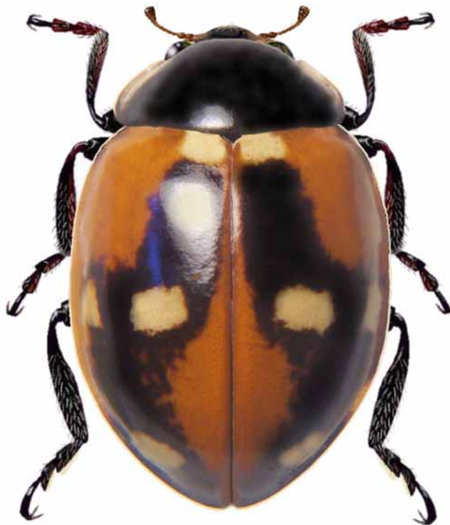
FIGURE 1. Habitus of Cycloneda pretiosa Vandenberg & González, new species (female, paratype).

Diagnosis: Distinguished from other Cycloneda species by tarsal claw lacking a basal tooth (Fig. 2c), and distinctive tricolored elytron featuring a large sinuous black vitta and 3 or 4 yellowish cream-colored dots against a saturated red to orange background (Fig. 1). At present this is the only known species of Cycloneda where the tarsal claw is simply widened basally with a superficial medioventral notch (Fig. 2c), however two other members of the Cycloneda germainii species complex ( C. lacrimosa González & Vandenberg and C. disconsolata Vandenberg & González) have a basal tooth that is greatly reduced in length (Fig. 2b).