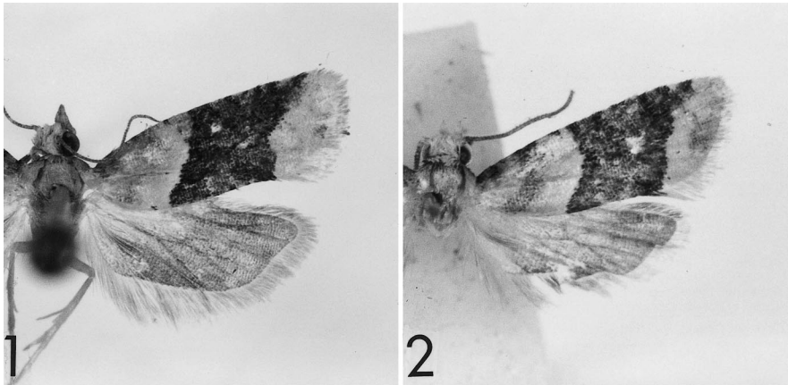
Figs. 1–2. Adults of Netechma . 1. N. caesiata (female); 2. N. similis (female).