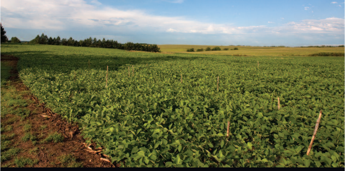
No-till soybean field