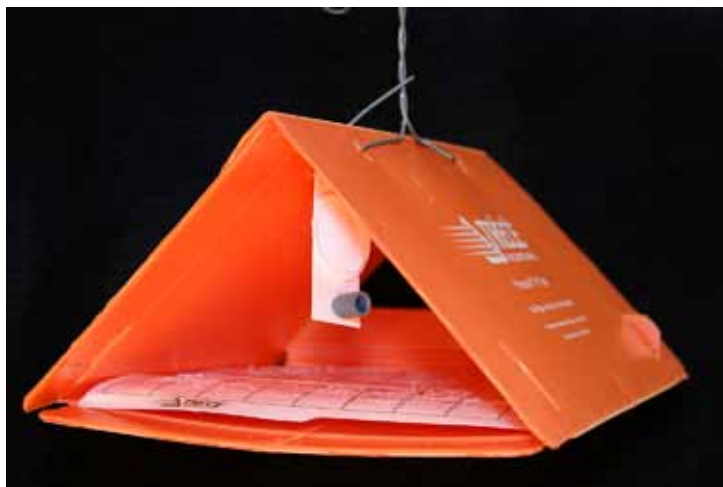
A trap baited with sex pheromone, pear ester, and acetic acid. ARS researchers and collaborators found that the combination of all three ingredients provides the best attractant for codling moths.