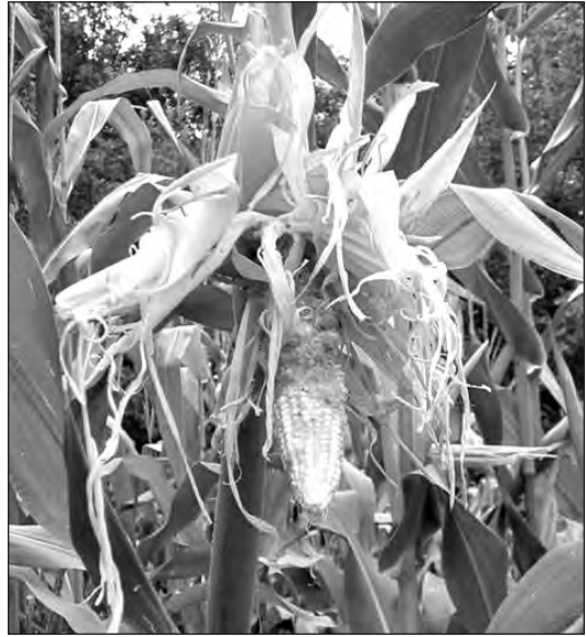
Damage to corn by wildlife.

The rate of crop damage was positively associated with the amount of forest edge in this study. Landscapes with larger amounts of edge are likely to support larger populations of wildlife species with affinities to edges and provide more opportunities for wildlife species to access crop fields. Consequently, edge availability may increase wildlife foraging pressure on crops. The species causing most