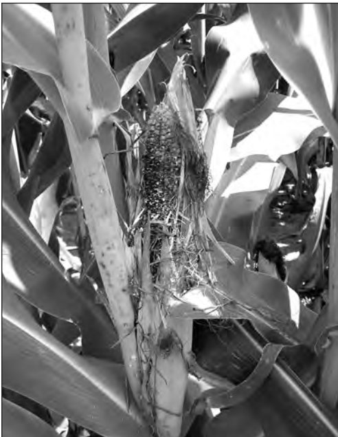
FIGURE 1. Raccoon damage to corn.

The 113,850-ha study area is located in the UWB in North-central Indiana, between the Missisnewa and the Salamonie reservoirs (Figure 2). The UWB drains an area >2,000,000 ha and represents >20% of the state's area (Swihart and Slade 2004). According to Moore and Swihart (2005), the remaining native forests (predominantly oak [ Quercus ], hickory [ Carya ], and maple [ Acer ]) in the UWB are highly fragmented; indeed, 75% of forest patches across 35 landscapes we analyzed in the basin were <5 ha. In addition, relatively large contiguous forest tracts in the basin are confined to major drainages where floodplains or locally steep topography make land unsuitable for agriculture; 86% of forest patches larger than 100 ha within the UWB were <15 km from the