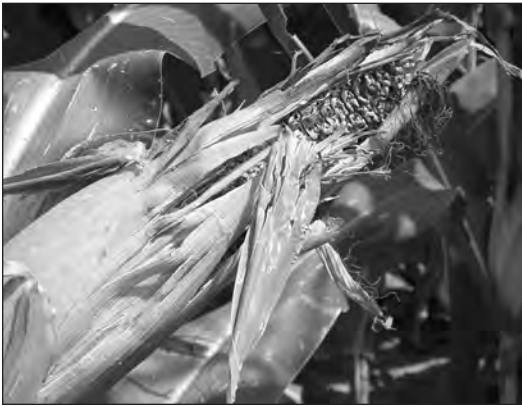
Corn damaged by birds.

landscapes providing more forest edge, the size of forest patches might also play a key role in determining species distribution and abundance. Larger and more complex forest patches might be more favorable to wildlife species than smaller and less complex patches.