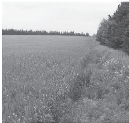
Figure 1. Windbreak, flowers, crop production

As an agricultural state, much of Nebraska's landscape is devoted to working farms and ranches. To improve the sustainability of this land and associated rural communities, it has become increasingly necessary to view agricultural land as an agricultural ecosystem, or agroecosystem, which is part of nature and a source of a variety of ecosystem services. Agricultural practices such as conservation buffers, agroforestry, mixed-farm systems, and organic management can improve the quality of these and other services. These practices improve habitat for pollinators, natural enemies of crop pests, and wildlife. They also provide food and fiber, sequester carbon, moderate crop microclimate, and reduce soil loss.