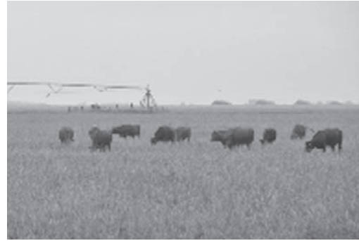
Cattle graze on the lands at the Meat Animal Research Center near Clay Center.