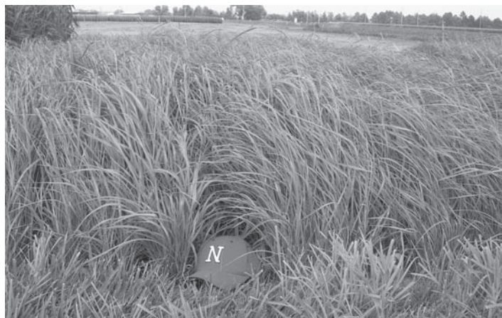
Figure 2. Teff growth in early August. Plots had been harvested 26 days earlier.

Teff can be grown with relatively low inputs. Thus far, insects and diseases have not been a serious problem on teff, but as the crop gets used more extensively, it is likely that pests will become more common. Broadleaf weeds can be controlled following herbicide programs, similar to other annual grasses. Although teff does not require high rates of nitrogen fertilizer, it uses small additions quite efficiently. At North Platte, 70 pounds of N per acre under irrigation produced an additional 1.6 tons of hay per acre.