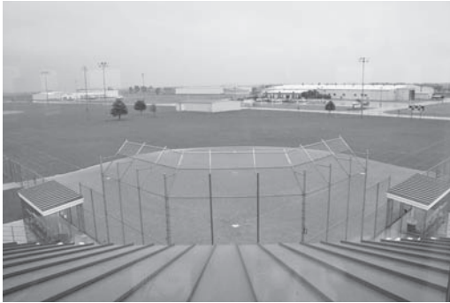
A view from the tower at the Smith Softball Complex in Hastings.

area, showed a map of the current properties, and explained DU’s process of purchasing and restoring properties and often putting them back on the market with a conservation easement in place. Tim and Matt discussed the high diversity local “ecotype” seed used on the restorations and the general techniques used in the wetland and upland to complete the restoration. We toured multiple sites that were in various