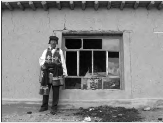
Figure 2. Damaged homes in Lari caused by brown bears. The destruction observed included (a) broken windows, (b) broken walls, and (c) broken furniture.