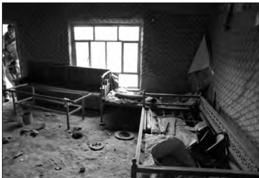
Figure 2 c.

and chimneys and generally destroy the homes as they consume stored food (Figure 2b and 2c). This was reported to be happening widely in the region with no apparent association with