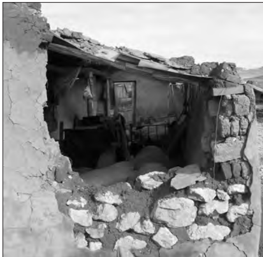
Figure 2 b.