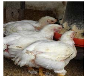
Baby chicks in the study at waterer (L) and older broilers feeding on sorghum (R)