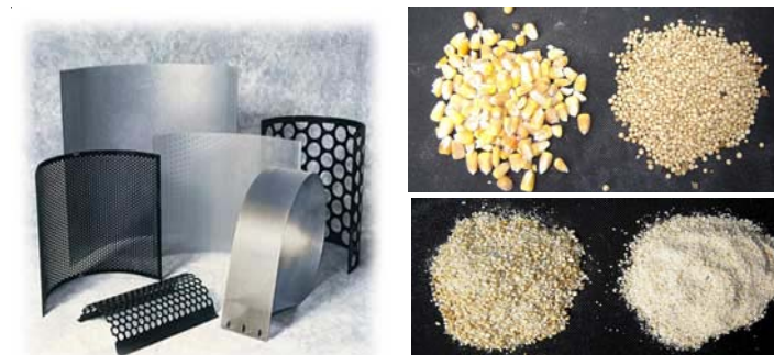
Hammermill screens for producing various grain particle sizes (upper left), whole maize and sorghum kernels (upper right) and ground sorghum (two particle sizes) (lower right).

Feed particles impact in two areas of poultry feeding. First, broilers and layers eat using their own sensory perception of the food which includes preference for certain sized particles. Second, particle size impacts directly the manner in which chickens utilize the nutrients in their diet, both in the case of laying hens and broilers. Rate of particle breakdown in the proximal small intestine is affected by grain particle size. Data from KSU suggests that particle size of the feeding ration is of major importance as regards to nutritional value to the broilers, and that the feeding value of U.S. sorghum is comparable to U.S. maize when ground to an appropriate 5 mm or less particle size.