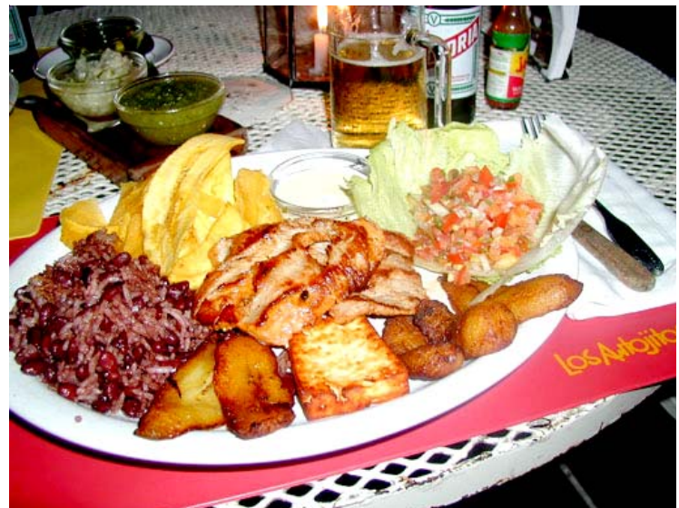
Gallo Pinto in Nicaragua

The Central American INTSORMIL project is dedicated to the promotion of sorghum as a feed for the burgeoning poultry industry. Poultry nutrition, for both broilers and egg production, is a major subject