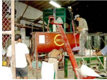
Mixing poultry rations in a Nicaraguan mill

In the Nicaraguan study, seven hundred twenty 1-d-old broiler chicks (Cobb x Cobb with an average initial body weight of 43 g) were used in a 14-d growth assay to determine the nutritional value of maize (No. 2 yellow maize imported from the United States) vs sorghum grain (Pinolero-1, a locally adapted variety with white seeds). The maize and sorghum were ground through a hammermill with screens having 6.3 vs 4 mm diameter openings.