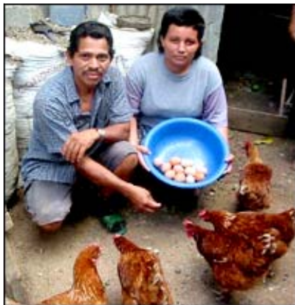
"In good hands with INTSORMIL"

Sorghum is an important crop in Nicaragua, grown largely to feed the thriving livestock industry, but it is also cultivated for food security