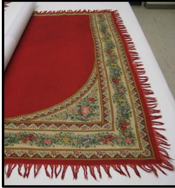
Figure 1. Half view of shawl, MMA 46.180, shawl, Nadezhda Merlina Factory, Russia, 19 th century, 1835 to 1855, wool, L. 58 x W. 60 inches (147.3 x 152.4 cm) Made in: Podriadnikova, Yegoryevsk District, Riazan Province, Rogers Fund, 1946

Note: The Antonio Ratti Center attributes this shawl to the Dmitri Kolokoltzev Factory, Saratov province, ca. 1830.