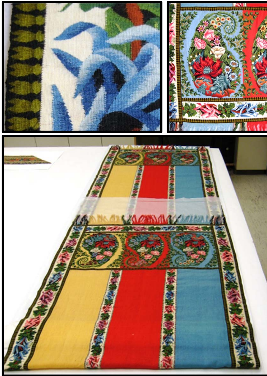
Figure 2. Folded view, shawl or scarf, MMA 65.919.1, Russian, 19 th century, 1820s to 1850s, wool L. 95 x W. 23¾ inches (241.3 x 60.3 cm), Rogers Fund, 1965

Figure 3, top left and right. Details of MMA 65.919.1 Elaborate Russian flowers bloom in the Eastern influenced botch of this tri color, striped shawl. Although unattributed, the workmanship is outstanding; the fine dovetailing is imperceptible. Truly two sided, this shawl could have accessorized Empire styled dress of the early 19 th century, but more probably it was woven after 1825. The extremely bright colors recall the color schemes of triumphant interiors in the Russian Empire style, still fashionable in aristocratic homes during the reign of Nicholas I.