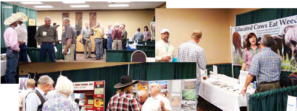
Conference goers enjoy interacting with company and organization reps at their exhibit booths.

Outstanding Wed. AM session to address the acute concern of drought.