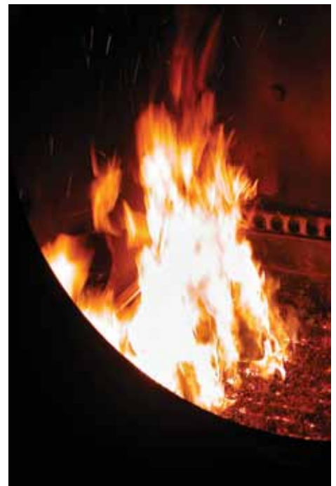
MATT MYERS (D2785-1)

Biomass pellets burning inside the boiler furnace chamber supply radiant heat for all 8 acres of greenhouses at Plainview Growers.