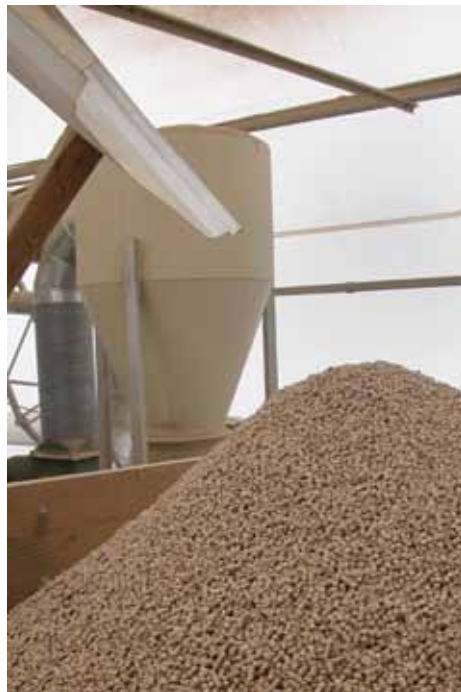
MATT MYERS (D2786-2)

Biomass pellets produced from the die shown at left. They can be burned as a renewable fuel source to heat greenhouses and other buildings.