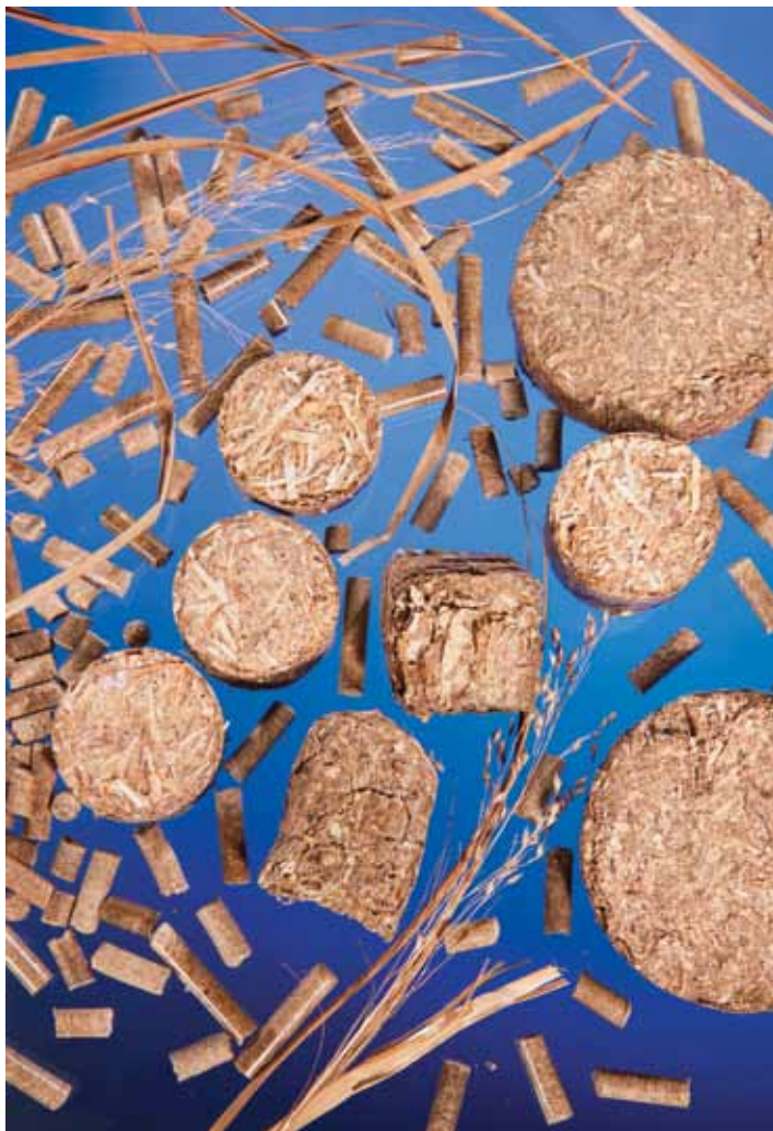
Switchgrass can be formed into pellets, cubes, and round briquettes that can be used to heat homes and businesses instead of fuel oil.