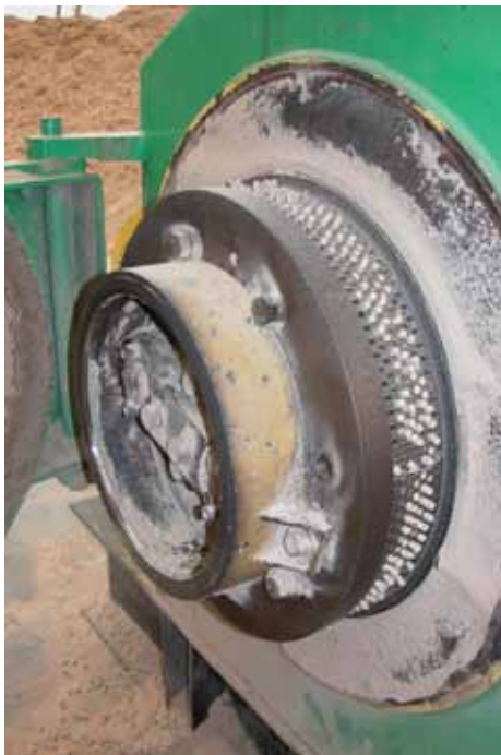
MATT MYERS (D2786-1)

A die extrudes pellets at the pellet mill of Plainview Growers in Allamuchy, New Jersey, as a feedstock for heating greenhouses.