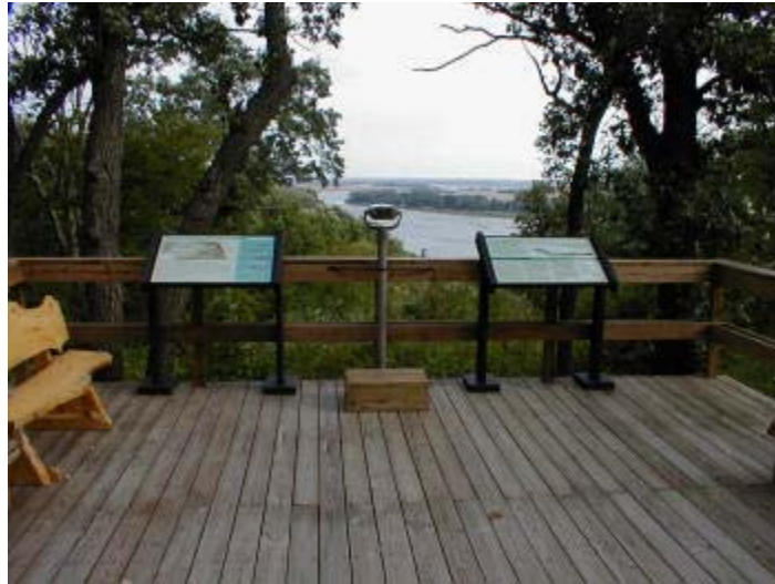
The new Lewis and Clark sign is on the right.