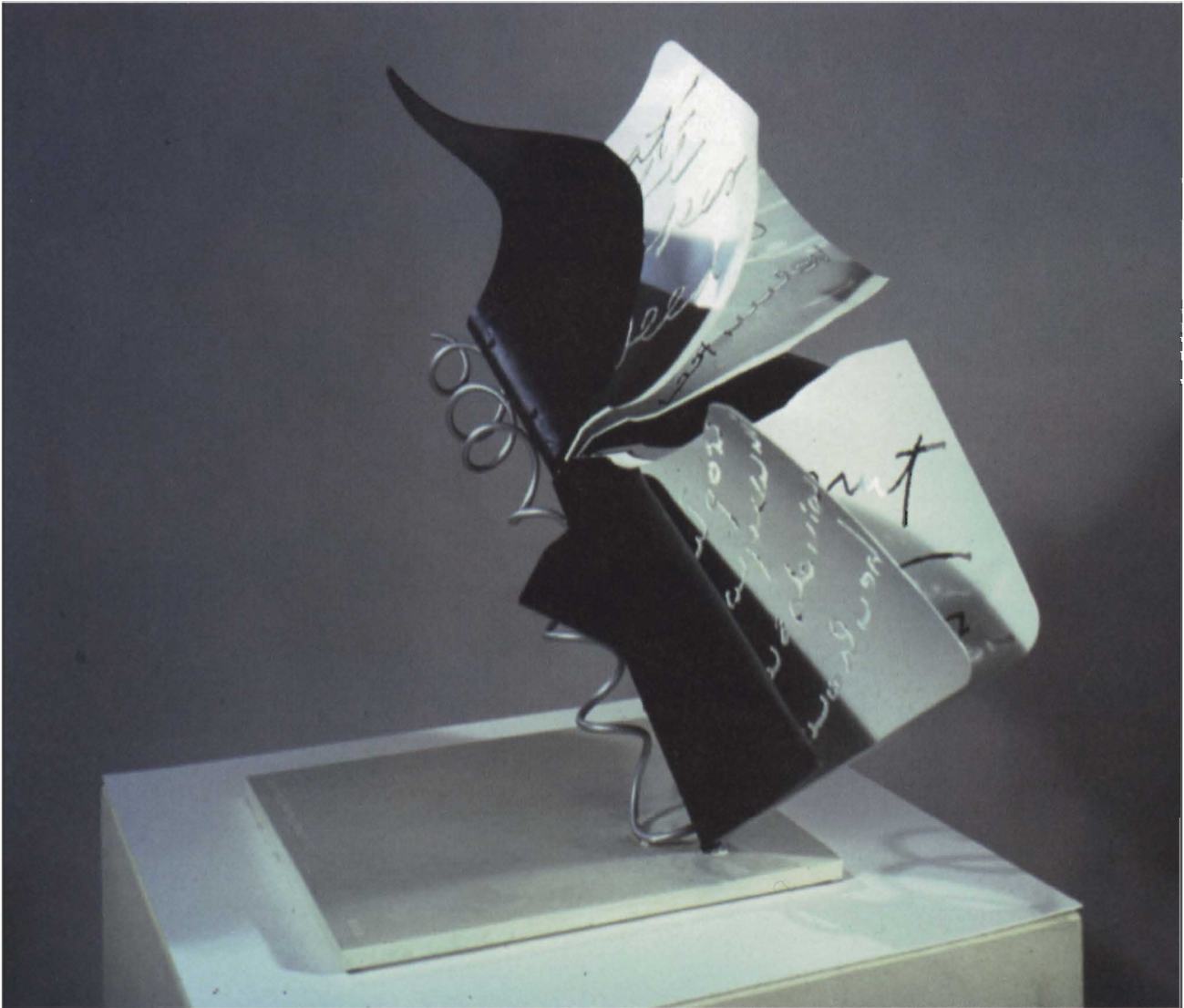
Figure 5: Untitled (maquette), painted metal, Sheldon Memorial Art Gallery and Sculpture Garden, University of Nebraska-Lincoln, Gift of the artist

T he professional staff of the Sheldon Memorial Art Gallery, University of Nebraska-Lincoln, is committed to making the exceptional permanent collection available to all Nebraskans. The Sheldon Statewide program realizes that goal by circulating outstanding works of art to communities throughout the state. We appreciate the many local sponsors who support the exhibition in their communities. Their generosity has enabled thousands of fellow citizens to encounter important works of American art. Perhaps the most significant component of this collaborative venture is the effort of many volunteer docents at each venue. Their willingness to receive information and disseminate it to the schoolchildren and adults of Nebraska is the vital link that connects the Sheldon staff, the supporters, and viewers of each statewide exhibition.