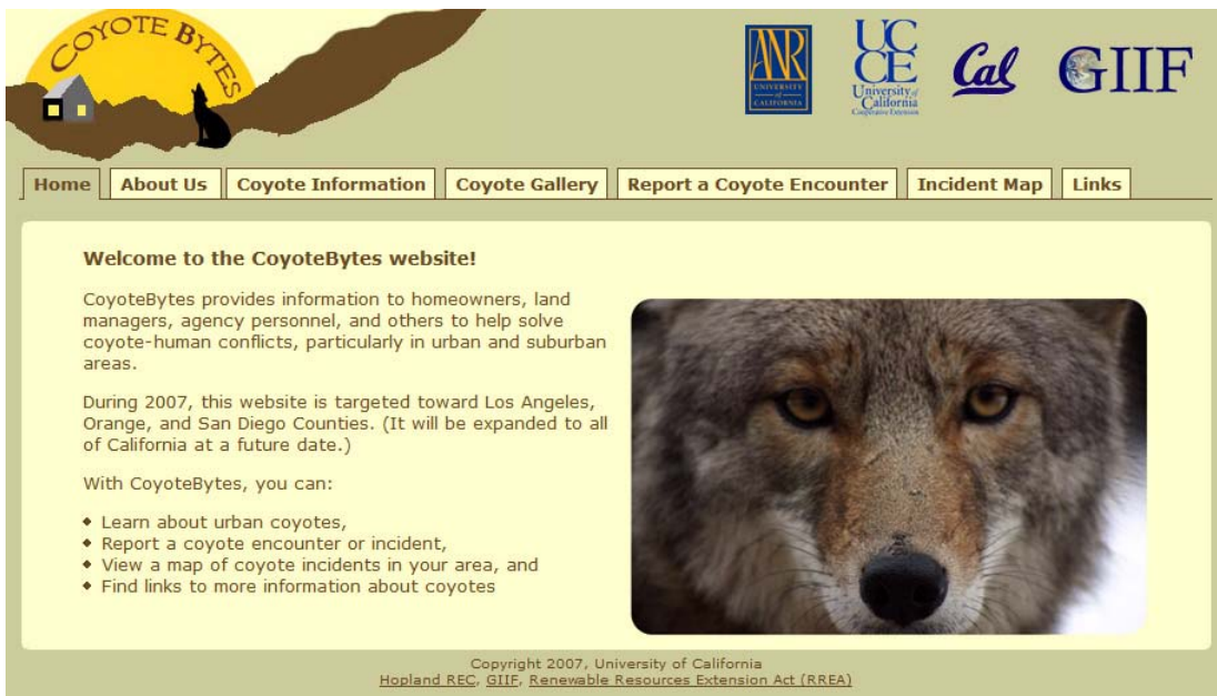
Figure 1. Home page of website www.CoyoteBytes.org.

Other publications included for viewing or downloading are the California Department of Fish and Game's "Keep Me Wild" poster and brochure about coyotes; the United States Department of Agriculture Wildlife Services' 2-page fact sheet "Urban and Suburban Coyotes" (USDA 2002); and the chapter "Coyotes" from the Prevention and Control of Wildlife Damage (Green et al. 1994).