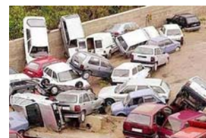
UNOPA parking lot on busy football game day.

Ever wondered what it felt like to wear red and provide that something extra to 160 University of Nebraska football fans? Well now is your chance!