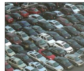
UNOPA parking lot on game day!.

Please Make A Greater Individual Commitment!