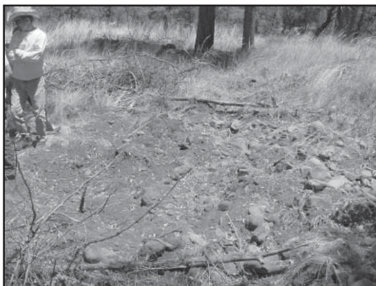
Destructive rooting behavior of feral hogs is evident in this picture taken in western Texas.

Feral hogs were trapped periodically from November 2002 to April 2003 using approximately 1- x 1- x 2-m box traps with rooter style