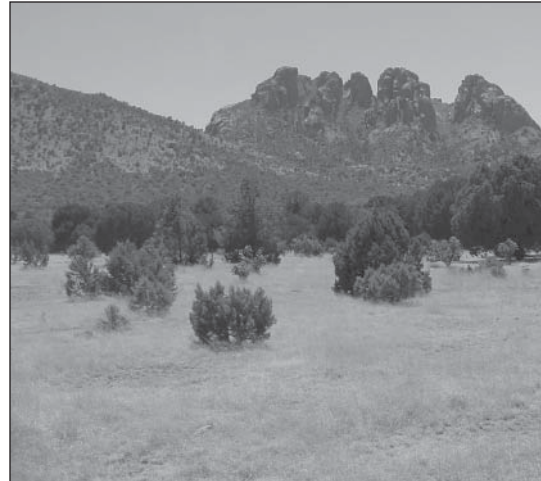
Western Texas landscape.

gates. Traps were constructed from 1.6-cm angle iron and 10.2-cm grid cattle panels. Trapping and handling procedures were approved by Sul Ross State University Animal Use and Care Committee and Texas Parks and Wildlife Department permit SPR-0592-525. Each trap was placed in an area of localized hog signs and pre-baited for several days with soured corn and carrion. Traps were checked every 24 hours. Captured feral hogs were sedated with a combination of telazol and xylazine at 4.4 mg/kg of estimated body weight delivered by a jab stick (Gabor et al. 1997). Sedated feral hogs were aged according to Matschke (1967), ear-tagged, and fitted with a mortality-sensitive radio collar (Advanced Telemetry Systems, Inc., Isanti, Minn.). Juveniles were defined as feral hogs that were born within the past year (young of the year). Efforts were made to radio-collar only 1 hog/sounder.