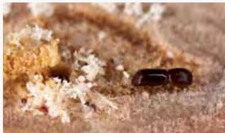
Female redbay ambrosia beetle, Xyleborus glabratus (about 2 mm long).

A foam originally developed by ARS as a way to pump fungal spores into the galleries of Formosan subterranean termites may be useful against ambrosia beetles that attack avocado trees.