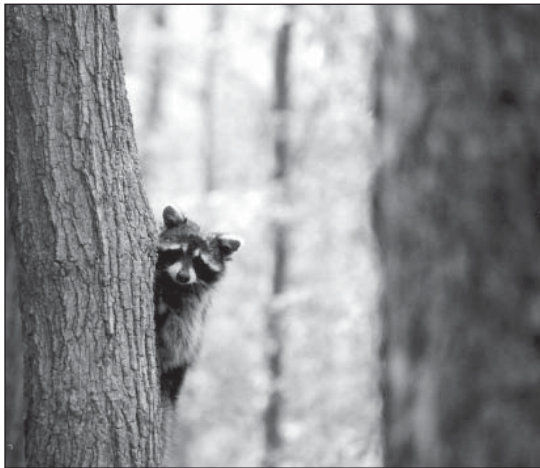
Raccoons are major wildlife consumers of field corn in northern Indiana.

fields) in 2003 and 78 fields (47; 31) in 2004 for evidence of wildlife damage to crops. Surveyed corn fields averaged 21.3 ha (SD = 18.9) in size; soybean fields averaged 24.3 ha (SD = 19.2). Most fields were rectangular, although some fields had curvilinear borders adjacent to woodlots, roads, drainage ditches, and grassed waterways.