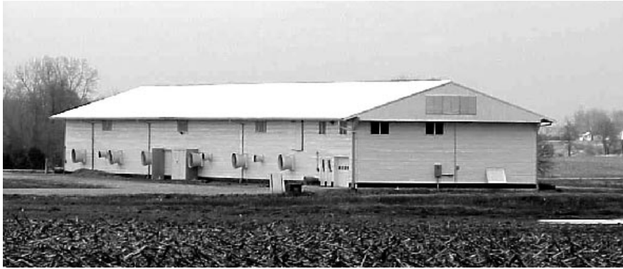
Figure 1. High-Rise™ Hog Building – 4-M Farms research/demonstration facility.