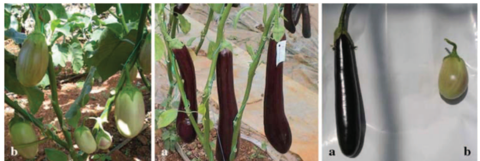
Figure 1. Plant and fruit architectures of fusarium wilt susceptible 'NSFB99' (a) and resistant 'LS2436' (b) eggplant ( Solanum melongena L.) genotypes

Phenotyping of the segregating populations for reaction to FOM was carried out in a climate-controlled greenhouse in BATEM, Antalya, Turkey. The seeds of the parents, F 1 , F 2 and BC 1 populations were first sown in sterile planting medium where healthy seedlings were produced and maintained until inoculation. The exper-