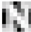
Figure 5: Extracted Watermark, magnified