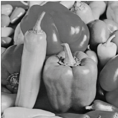
Figure 2: Original 512x512 image

Figures 2-7 illustrate an example taken from our test image set: Figure 2 shows the original 512x512 host image intended to be watermarked. Figure 3 shows the watermark message that is to be embedded into the host image. Figure 4 and 5 respectively show the watermarked image using the algorithm in [21] and the extracted watermark before the watermarked image has been attacked. It can be seen that the extracted watermark is a perfect replica of the embedded signal. Figures 6 and 7 show the image after Pseudo-CFA filtering and re-interpolation and the watermark signal extracted from it. It