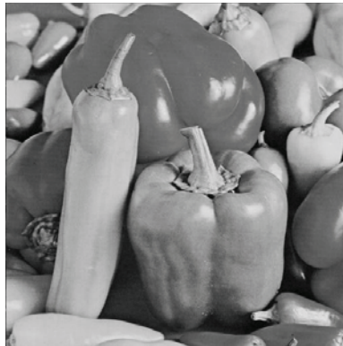
Figure 4: Watermarked image using algorithm in [21]