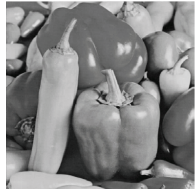
Figure 6: Watermarked Image after CFA filtering and re-interpolation