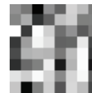
Figure 7: Extracted Watermark after attack, magnified