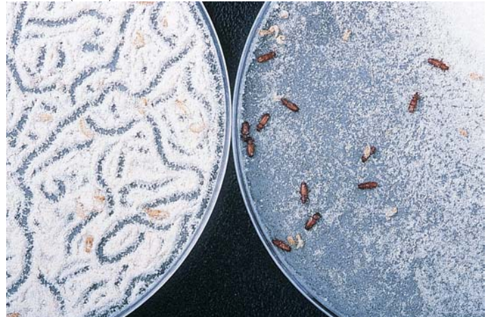
Left: Red flour beetle larvae exposed to concrete treated with the insect growth regulator hydroprene failed to grow to adulthood. Right: Healthy adults on untreated concrete.