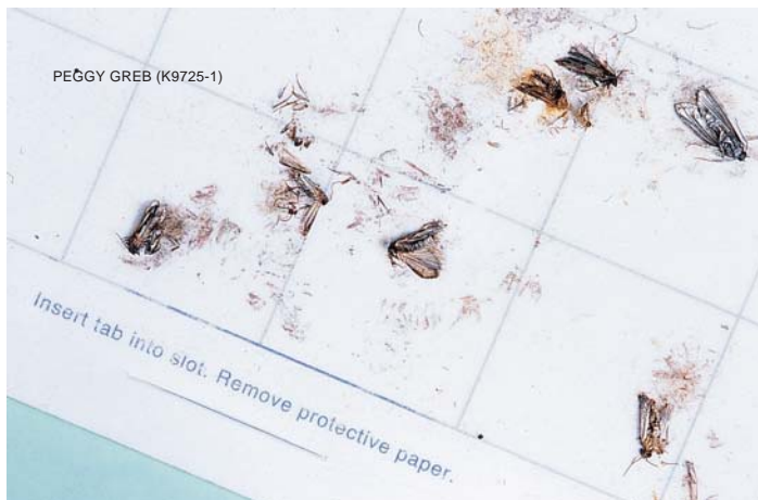
Indianmeal moths trapped on a pheromone trap.

Anyone who has ever been to a picnic knows insects are drawn to food. That's why developing new methods to keep insects out of food in packages, warehouses, and processing plants is critical for food manufacturers.