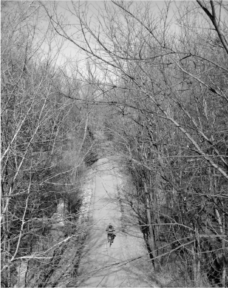
FIG. 2.—One of five urban forest corridors sampled along a bike trail in Lincoln, Nebraska

and Siberian elm ( Ulmus pumila ); however, a few samples could not be identified to species. The non-native, low-growing shrub wintercreeper ( Euonymus fortunei ) was observed in sites 1, 2 and 3 but was not recorded in the samples.