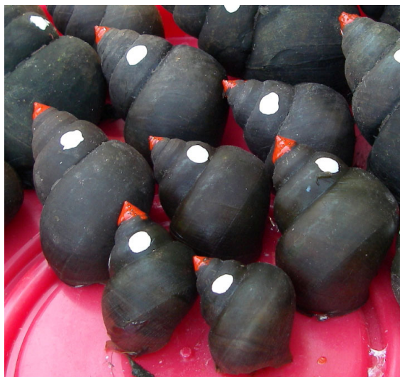
Figure 1. Chinese mystery snails marked with paint on the nuclear and penultimate whorls.

Given the potential impacts of invasive freshwater snail species and questions regarding the enumeration of snail populations, we utilized a mark-recapture technique to (a) determine its appropriateness for Chinese mystery snails and similar species and to (b) estimate the population of Chinese mystery snails within a Nebraska reservoir. We also developed estimates of density and biomass from the population estimate. This is the first known demonstration of applying mark-recapture techniques to generate a population estimate for the invasive Chinese mystery snail.