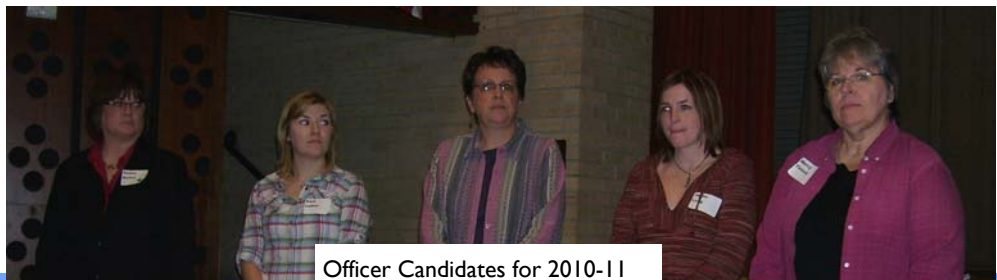
Officer Candidates for 2010-11