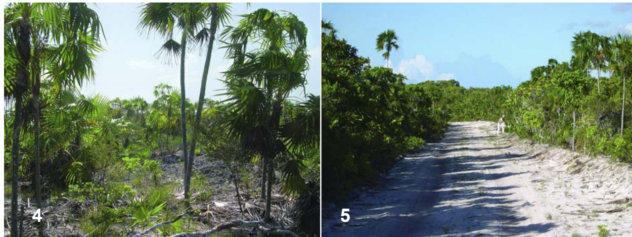
Figure 4-5. 4) Rocky outcrop in Coccothrinax inaguensis forest along south coast of Great Inagua. Photo by M. C. Thomas. 5) Roadside in Coccothrinax inaguensis forest along northwest coast of Great Inagua. Photo by M. C. Thomas.

The male parameres in caudal view resemble those of C. cubana (Chapin), but that species is almost twice the size of C. dolichotarsa , has a shorter antennal club, stout meso- and metatarsomeres, an epipleural flange on the elytral margin of the female, and short, blunt parameres in lateral view.