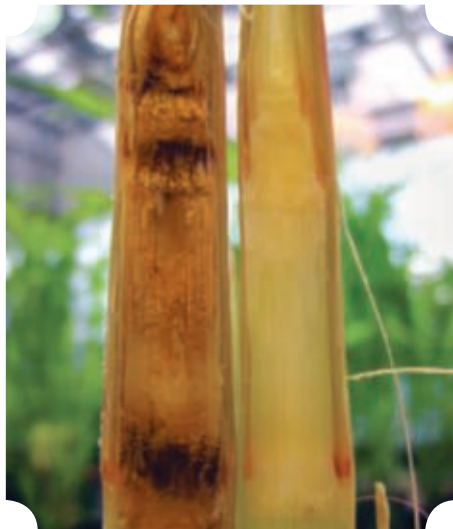
ERIC SCHMELZ (D2388-1)

Cross-sections of a corn stem infected (left) and not infected (right) with Fusarium graminearum . ARS scientists have worked to characterize plant defenses induced by Fusarium infection.