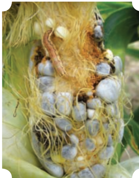
ERIC SCHMELZ (028390-1)

Maize faces pressure from insects and pathogens in the field. ARS researchers are investigating the protective role of maize phytoalexins against both types of attacking organisms. Here, a corn earworm feeds on a corn cob infected with corn smut (blue kernels).