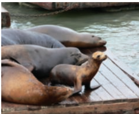
THE MARINE MAMMAL CENTER (D2394-1)

Less is known about leptospirosis in wildlife, such as California sea lions, but scientists are finding out how the disease is spread in these mammals, exploring vaccines for cattle that carry the virus,