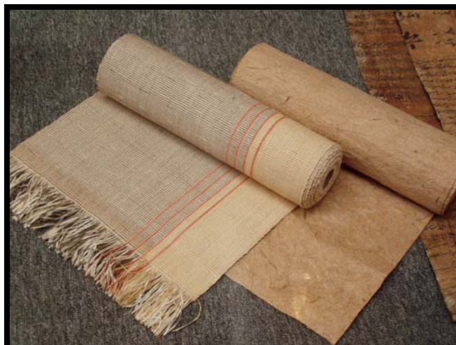
Figure 2. Washi-textile, shifu (left) and washi-cloth (right)

The methods of the research are as follows. First, I examined the history of Tosa-washi from the literature and museum materials of Japanese Paper Museum Ino Town , Kochi. Second, I have made field survey on the manufacture of Tosa-washi since 2005 in Ino Town, then I interviewed with the two craftswomen who make washi by hand and weave shifu about the character of their creation. The third, I made field survey at Tosa Cooperative House for handicapped children in 2007 and 2008, and at Houay Hong Vocational Training Center for Women in Vientiane, Laos in 2008 in order to examine the activities of a craftswoman. Shifu has been worn as clothes by changing the nature into cloth from paper. Then what kinds of socio-cultural meanings does shifu have in the modern Japanese society? I examine the meanings of the creation of two craftswomen.