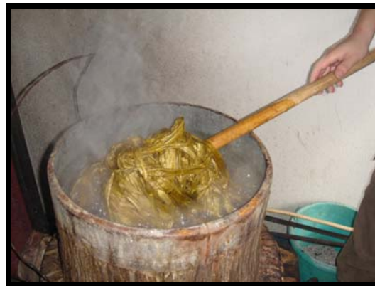
Figure 5 (left). Peeling the outer skin of mulberry. Figure 6 (right). Boiling mulberry