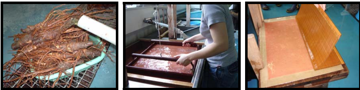
Figure 7 (left). The root stem of tororoaoi (Abelmoschus manihot).