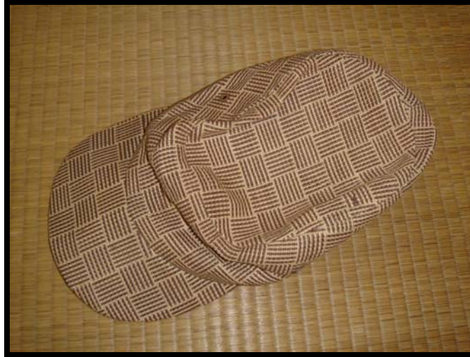
Figure 4. The hat made from shifu in the Taisho period (Kochi Prefectural Paper Technology Center Ino Town)

Washi manufacture and weaving shifu have been done in Ino and the hats and the bags were made in the former half of the twentieth century (Fig. 4.) Nowadays, shifu has been used for kimono and obi for special occasions and seldom used in daily life.