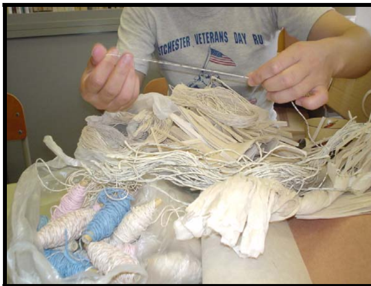
Figure 10. Washi thread making.