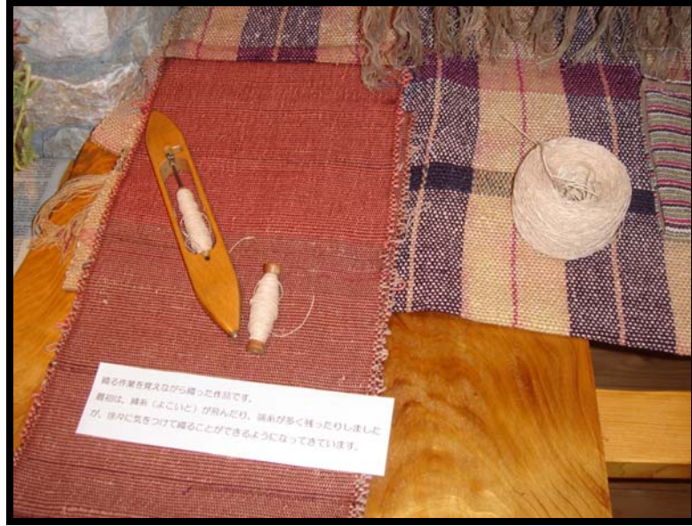
Figure 13. (Right) The exhibition of shifu by the trainees of Tosa Cooperative House.