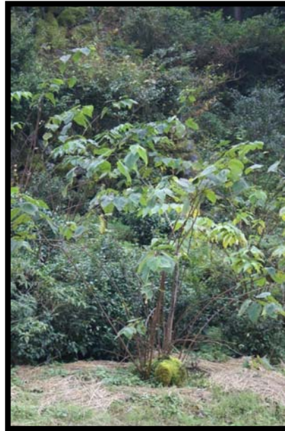
Figure 1. Mulberry ( Broussonetia Kazinoki × B.papyrifera ).

Tosa-washi (Japanese paper from Kochi Prefecture in Shikoku, Japan) has been made in Kochi since the tenth century and Tosa-washi which was the first product of Tosa region was supplied to the Edo shogunate in the Edo period of the seventeenth century. The manufacture of Tosa-washi has been placed on the traditional industry of Kochi until now. It was specified in The Traditional Craftwork of the country in 1976, and specified in The Important Intangible Cultural Asset of the country in 2001. This study focuses on the creative activities of two craftswomen who weave washi -textile called shifu using Tosa-washi , and I examine the socio-cultural meaning of woven cloth.