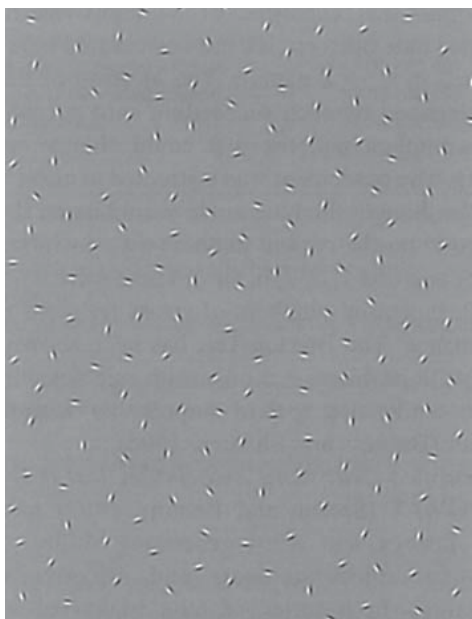
Fig. 1. Example of a test card. A closed path of Gabor signals is embedded in noise. The observer is asked to locate the position of the contour. The ratio of element spacing in the noise background to spacing along the contour ( D ) is 1.0 in this example.

three consecutive days as an index of learning and visual context processing. It consists of 15 cards which contain varying numbers of Gabor elements against a uniform gray background (see Fig. 1). Contour integration is a basic process of the visual system, involving the linking of correlated visual features (in this case, based on orientation information) so they are perceived as coherent wholes. The test is thought to involve long-range horizontal connections between spatial filters in the visual system that are thought to be identical to the long-range connections necessary to dynamically group contextually-related bits of information together in other areas of cognition such as selective attention, memory, and learning (Phillips and Singer, 1997). Therefore, contour integration is a basic measure of context processing. In non-clinical populations, contour integration ability gradually develops throughout childhood and adolescence (Kovacs et al., 1999). In schizophrenic populations, impaired task performance has been correlated with higher levels of disorganized symptomatology (Silverstein et al., 2000). The participant's task was to detect and trace the circular contour that is formed