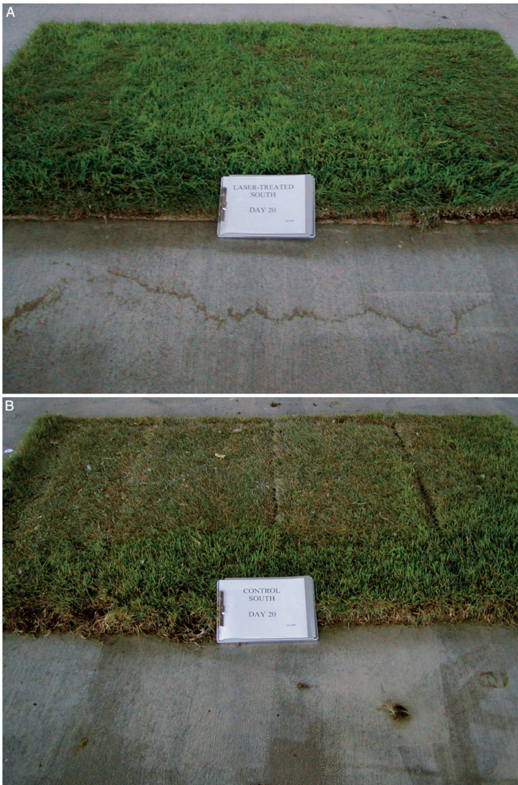
Figure 3. Grass sod from a laser-hazed (A) and control (B) subplot subsequent to the 20-day habituation test of a laser hazing system for repelling Canada geese.