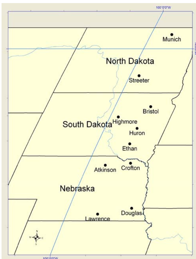
Fig. 1 Location of field sites where switchgrass was managed as a bioenergy crop

The climatic conditions were in general not favorable during these years, as seven of the ten sites experienced rainfall below the 30-year mean, and all but Munich, ND, experienced temperatures above normal (for weather data by site, see Table 10 which is published as supporting informa-