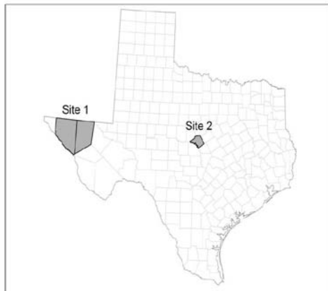
Figure 1. Two different study sites in Texas were used for this study; Site 1 was located in west Texas in Hudspeth and Culberson Counties and Site 2 was located in central Texas in Mills County.

To provide a context for the use of BCA to estimate the cost savings associated with trap monitoring systems, two different WS trapping locations in Texas are used as examples: Site 1 is located in West Texas in Hudspeth and Culberson Counties, and Site 2 is located in central Texas in Mills County (Fig. 1).