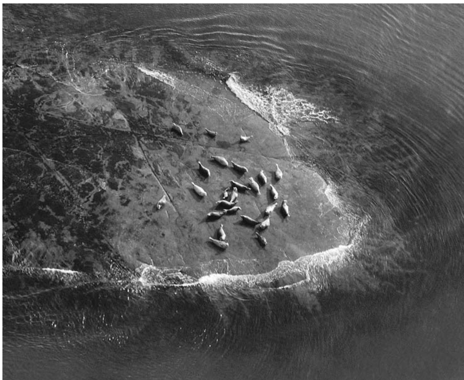
PLATE 1. Hauled-out harbor seals photographed during aerial surveys.

adjusted to conditions of the covariates that yield the maximum counts (we call these the optimum conditions). Observed counts are adjusted to optimum conditions because it is not possible to be at every site at low tide at noon every day of every annual survey period due to tidal fluctuations, weather, and logistics (Ver Hoef and Frost 2003). The optimum date for both quasi-Poisson and negative binomial regression was the earliest date, 18 August. However, the adjusted estimate of harbor seal abundance using a quasi-Poisson regression was 38 884 on 18 August, while using a negative binomial regression it was 80 609. Clearly, the choice of the regression method has a large impact on our abundance estimate.