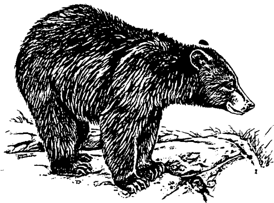
Black bear, ursus americanus