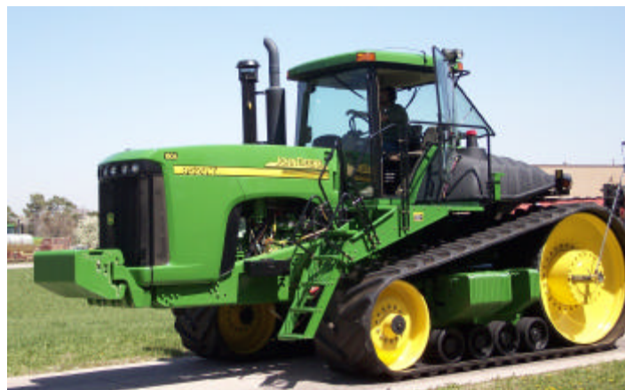
JOHN DEERE 9520T DIESEL