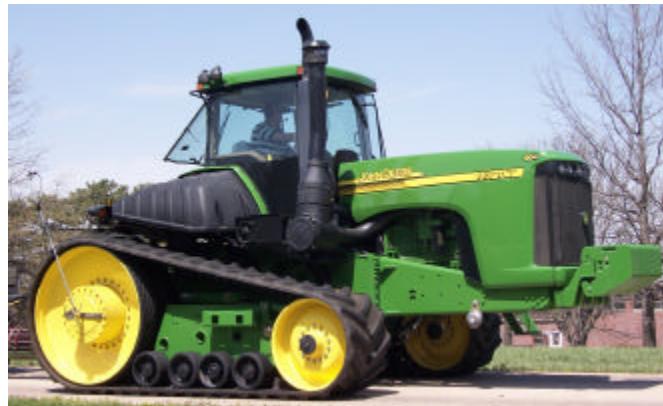
JOHN DEERE 9320T DIESEL