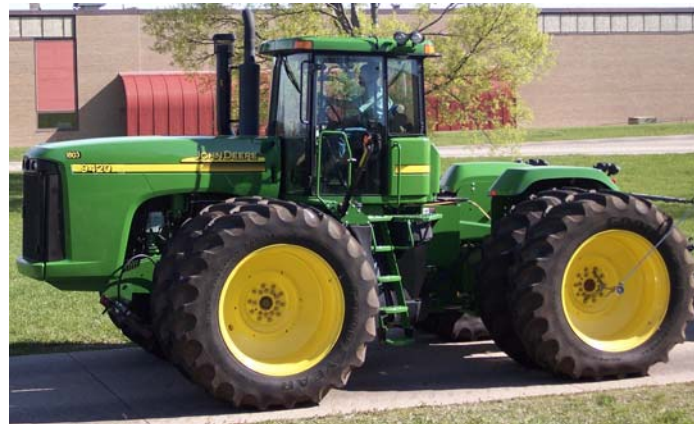
JOHN DEERE 9420 DIESEL