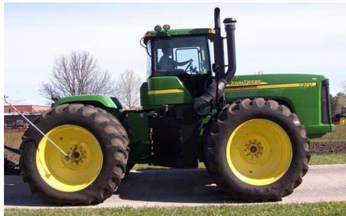
JOHN DEERE 9320 DIESEL