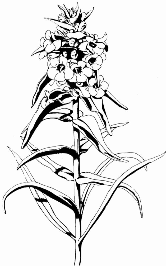
FIGURE 1. Sketch of a flowering stem of Penstemon haydenii made from a photograph.

Penstemon haydenii S. Wats., blowout penstemon (Fig. 1), is the only Nebraska endemic flowering plant, and it has recently been listed as an endangered species by the Fish and Wildlife Service (1987). It is found only in active areas of wind erosion (blowouts) in the Sand Hills region of Nebraska (Fig. 2), but it is by no means in every blowout. In fact, after rather extensive searches and after following up on many suggestions from Sand Hills residents, Stubbendieck, Weedon, Traeger, and Lindgren (1982) were able to locate only eight populations. At present, P. haydenii is known to consist of perhaps two thousand plants at scattered locations in Box Butte, Cherry, Garden, Hooker, Morrill, and Sheridan counties (Fish and Wildlife Service, 1987). A number of old collections also exist from Thomas County, although the plant has not been seen there recently. Because of the rarity of the plant and the inadequacy of labeling on many of the existing specimens, there has been considerable confusion about its distribution and doubt about the correct botanical typification.