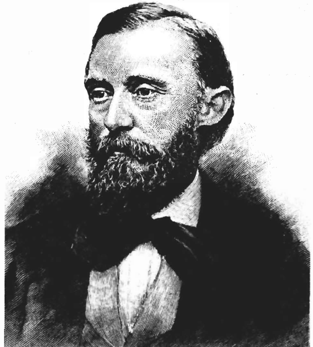
FIGURE 3. Portrait of Ferdinand V. Hayden (from White, 1895).