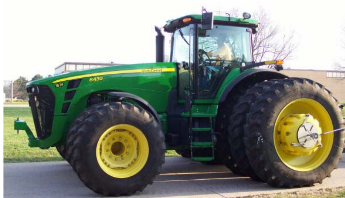
JOHN DEERE 8430 IVT DIESEL

Institute of Agriculture and Natural Resources University of Nebraska-Lincoln