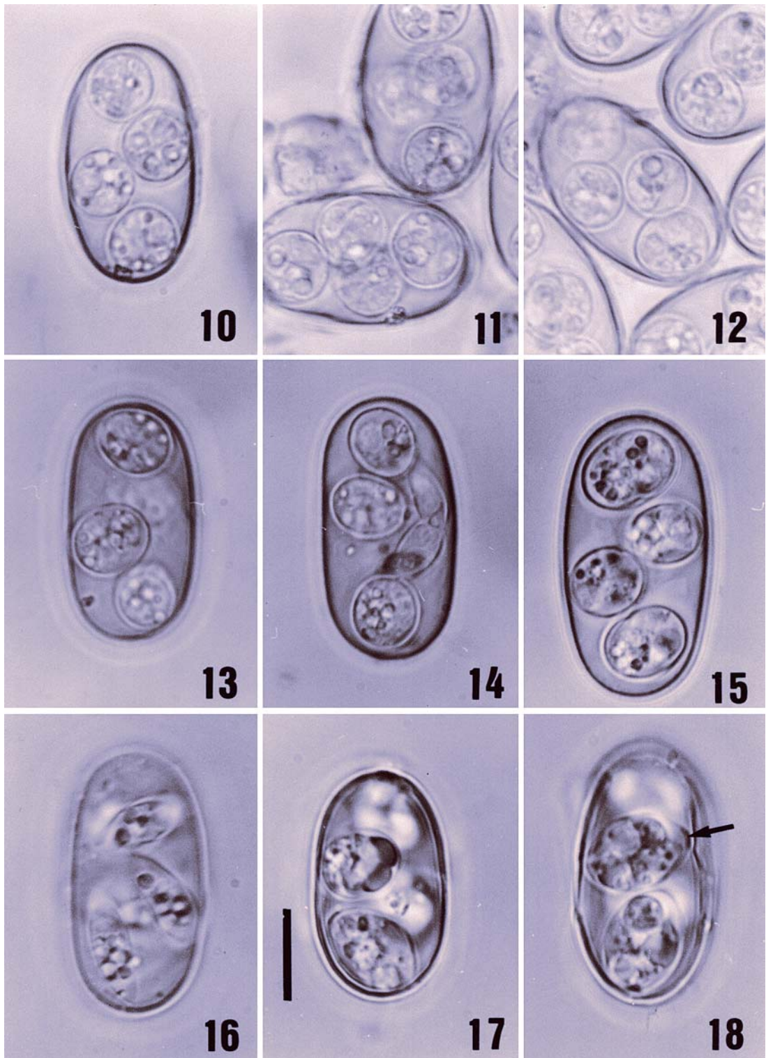
Figures 10–18. Photomicrographs of elongate-ellipsoidal sporulated oocysts from colubrid snakes of Guatemala. 10–12. Eimeria leptophis n. sp. 13–14. E. oxybelis n. sp. 15–16. E. scaphiodontophis n. sp. 17–18. E. siboni n. sp (note SB, arrowed). Scale-bar: 10 \mu m.