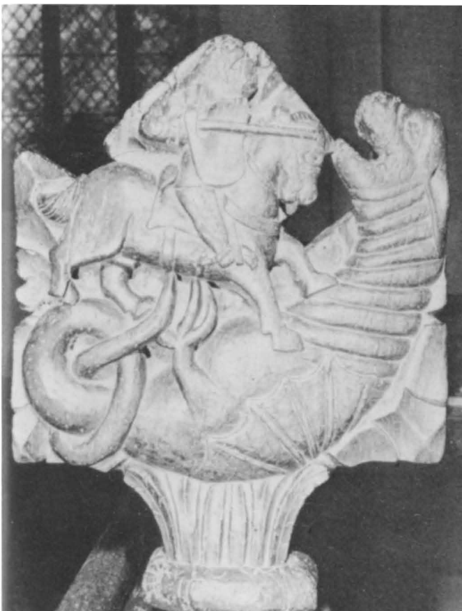
FIGURE 3. St. George and the dragon.

4. Activities of parishioners included such actions as (a) a sower; (b) a woman binding a sheaf of corn (wheat in the United States); (c) a thatcher with a rake (Fig. 4). It is interesting