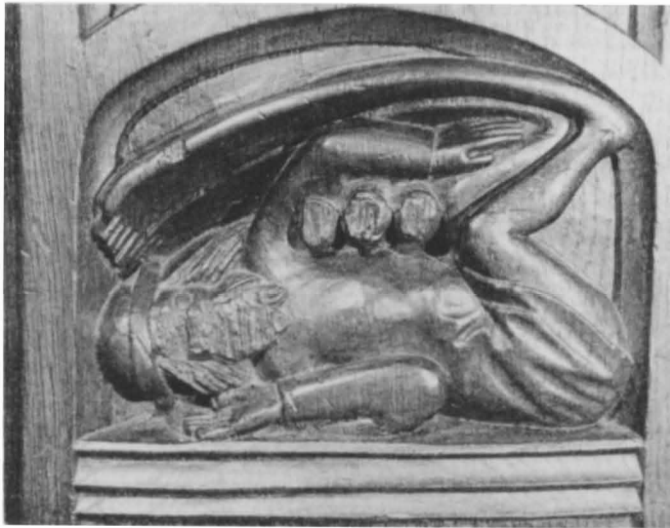
FIGURE 10. A skiapod.

on unsuspecting birds. When it steals chickens, this symbolized the devil capturing souls. It is also shown, as are apes and other humorous animals, acting as a preacher. (k) Finally, there are combinations of the various parts of animals scrambled together, such as: two-headed animals and birds, dragons, animals or fish swallowing fish, quadrupeds (for humans), mild