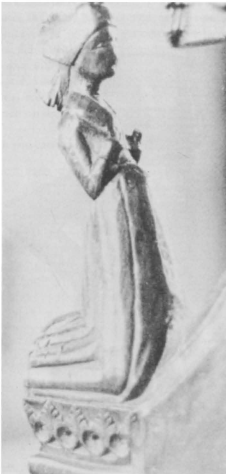
FIGURE 5. Kneeling woman, praying, and looking toward the poppyhead.

5. Animals and birds without any symbolic meaning were often carved, some from observation, others from illustrations in bestiary books. These were dogs, rabbits, horses, mules, camels, elephants, squirrels (Fig. 7), fish, whales, seals, birds—from eagles to doves to a cockerel (young male domestic fowl). Birds predominate, probably because of the large numbers of different kinds of birds to be seen in East Anglia.