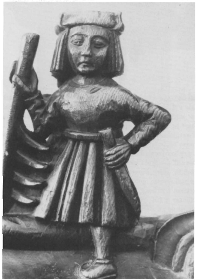
FIGURE 4. The thatcher with his rake.