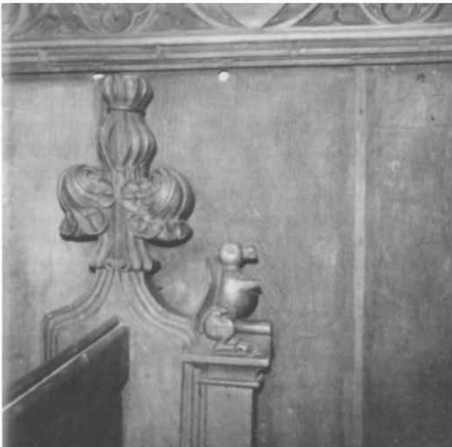
FIGURE 7. A poppyhead and a squirrel on a bench end at the Barningham church.