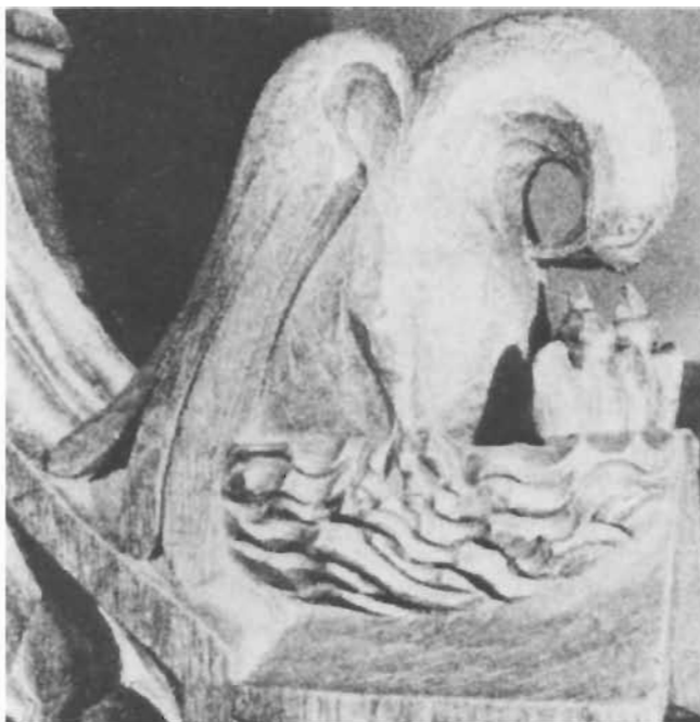
FIGURE 8. The pelican in its piety injuring itself to feed its young.

deadly glance hatched by a reptile from a cock's egg) had the head and wings of a cock, and the body of a serpent. If a man were seen by a cockatrice before he saw the cockatrice, he died, and vice versa. One was therefore advised to go forth with a mirror and if the cockatrice saw itself in the mirror, it would die and the man would live. (d) The mermaid represented a siren or wily woman. If she is depicted holding a fish, this symbolized an evil person holding a soul. (e) The owl symbolized perverse foolishness, or a person living wilfully in outer darkness. (This seems odd, because in present day, an owl represents wisdom!) (f) The frog represented heretics wallowing in sensuality. (g) A skiapod (Fig. 10) is manlike with one enormous foot under which he rests as he would under an umbrella or parasol. The symbolism for this creature is not yet understood. (h) The elephant was depicted leaning against a tree because it had no joints in its legs. When the tree was chopped down by devils, the elephant fell. Finally, a young elephant (representing Christ) raises up the fallen elephant with his trunk (representing the resurrection). (i) The squirrel, believed to have crossed water on a piece of wood, symbolized man crossing the sea of life on a wooden cross (Fig. 7). (j) The fox is shown playing dead in order to pounce