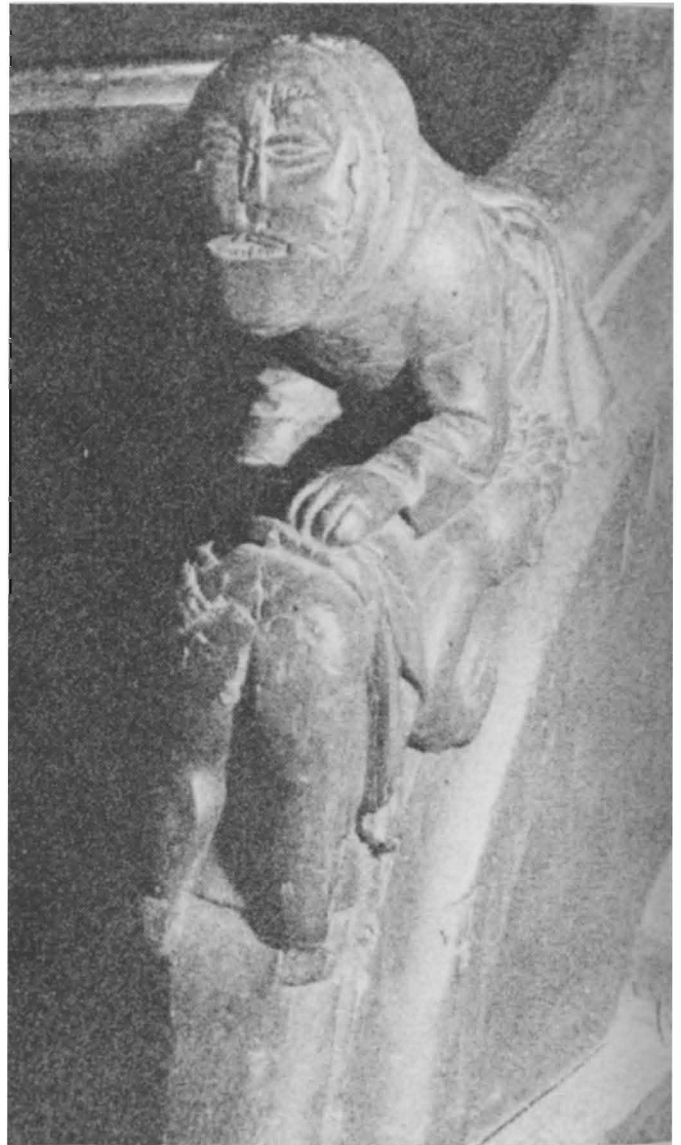
FIGURE 6. A woman spanking her son.

6. Grotesques were carved and given moral and theological significance. They were to bring to mind a person or a legend. Examples are: (a) A pelican (Fig. 8), in its piety a pelican wounded its breast with its bill in order to feed its young that are clustered below it. This conveyed the act of self-sacrificing devotion and therefore symbolized Jesus Christ (Agate, 1980). (b) The unicorn, with the body of a horse, feet of an elephant, tail of a stag, and one central long curved horn (Fig. 9). The horn is usually turned to the rear so that it will not be easily cut off. It was said that the unicorn could be captured only if a virgin sat in a forest. The unicorn would then place its head on her lap and could then be captured. This meant that it could be easily captured by hunters, devils, or evil persons. (c) The cockatrice (legendary serpent with a