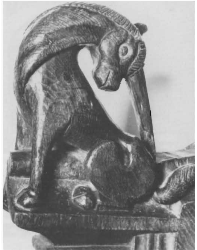
FIGURE 9. A unicorn.