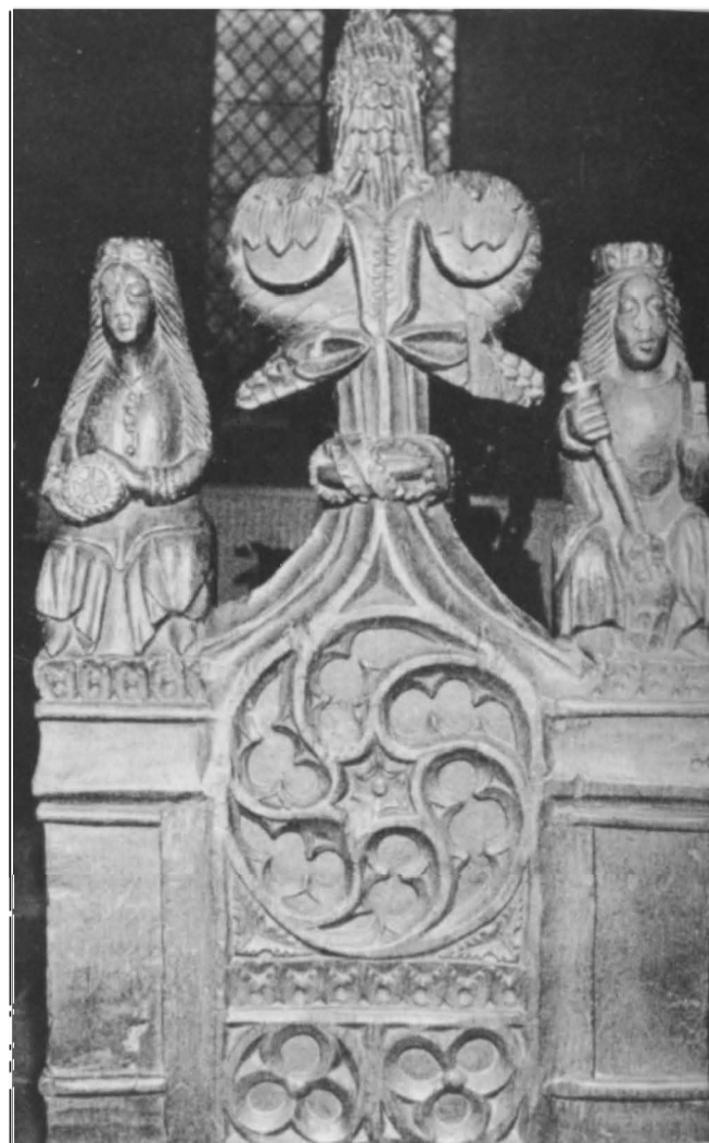
FIGURE 1. Poppyhead finial and bench end figures of Ste. Catherine and Ste. Margaret.

1. The saints were shown with their special associations, such as St. Peter holding a key, St. Andrew holding a diagonal cross, St. Paul with a sword, St. John with a poison cup from which he drank without fatal results, St. Simon holding a fish, St. Jude with a boat, Ste. Catherine with a wheel, Ste. Margaret with a dragon, and Ste. Barbara in a prison tower (Figs. 1 and