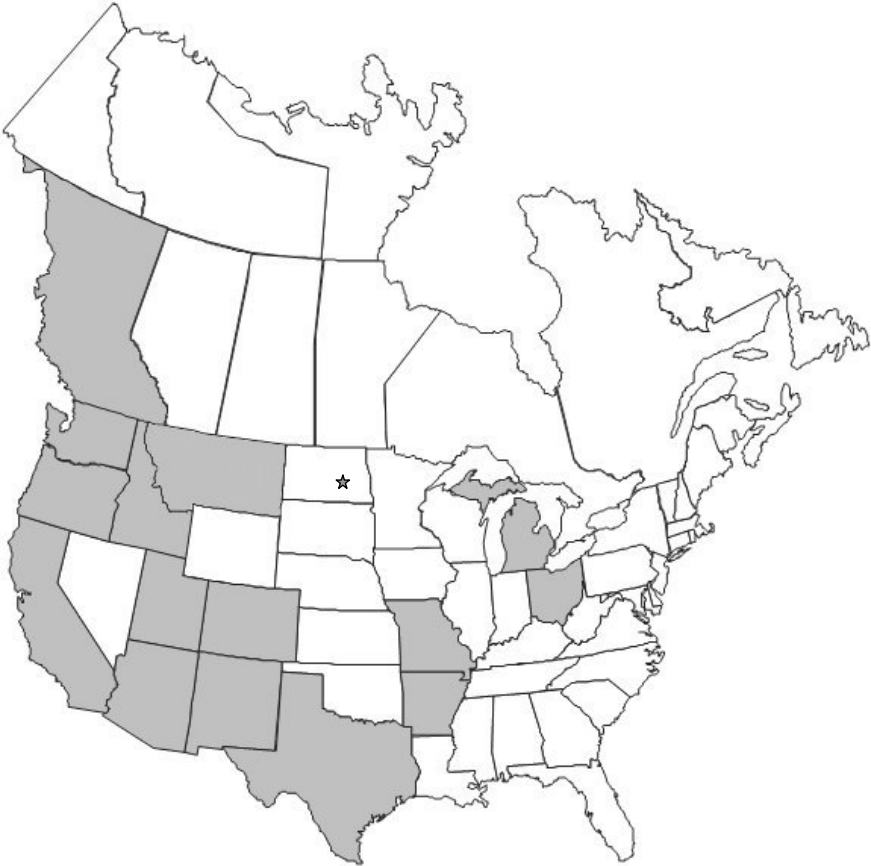
Figure 1. Recorded North American distribution of Corisella inscripta (Uhler). The star (*) indicates new records reported herein.