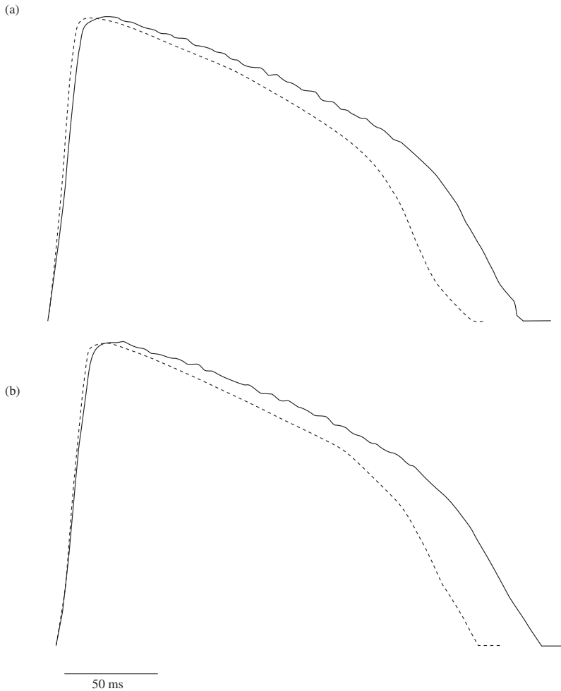
FIG. 1. Representative recordings of monophasic action potentials (MAPs) from the (a) spongy myocardium and (b) compact myocardium of the Thunnus albacares ventricle. Traces are the average of four recordings at a pacing frequency of 0.4 Hz (—) and 0.8 Hz (---). The y-axis has been normalized for both recordings.

The present investigation into the relationship between pacing frequency and MAPD in T. albacares found that MAPD is inversely proportional to pacing frequency. This phenomenon, known as the interval–duration relationship, has been previously described in both mammals and fishes (Liu & Antzelevitch, 1995; Harwood et al. , 2000; Hanton et al. , 2001). The exact mechanism underlying the interval–duration relationship is unknown, but may involve incomplete decay of the delayed rectifier currents (Katz, 2006). Both Vornanen et al. (2002) and Galli et al. (2009) found evidence for a strong delayed rectifier current ( I_{kr} ) in O. mykiss and pacific bluefin tuna Thunnus orientalis (Temminck & Schlegel) heart, respectively, and it is plausible that this current also underlies the interval–duration relationship in T. albacares . A similar decrease in APD with increased stimulation frequency has