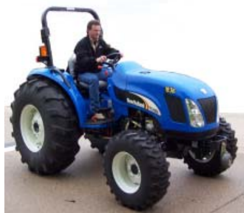
New Holland TC 48DA Diesel