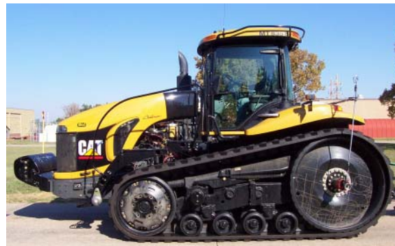
CHALLENGER MT835B DIESEL