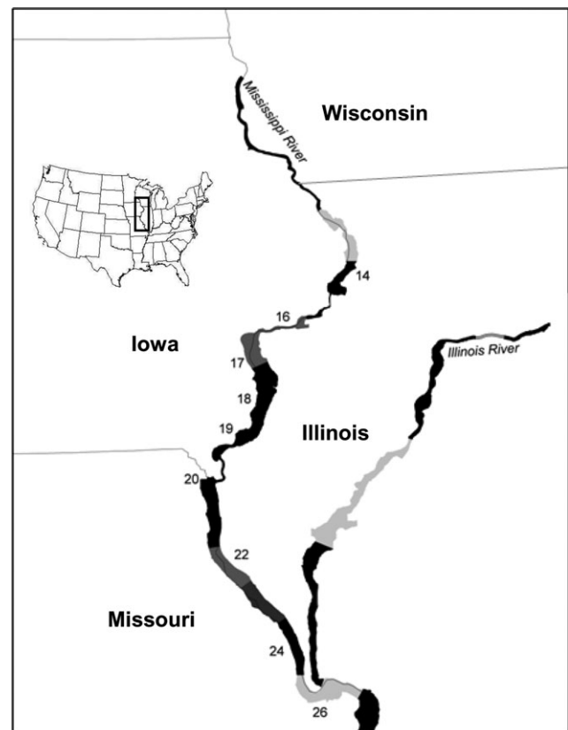
Fig. 1. Distribution of the study pools, Upper Mississippi River

Navigation that occurs exclusively within a pool could not be estimated with available data, but this component is thought to be localized around harbors and other off-loading facilities using smaller vessels.