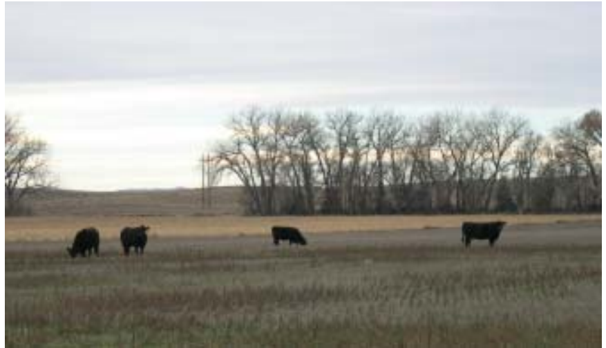
Figure 1. Cows graze winter wheat stubble near Bridgeport.

The effectiveness and profitability of grazing wheat forage depends on numerous factors. Producers can harvest wheat for grain only or they can harvest both the grain and forage (either through ownership of the cattle or leasing the pasture), or they can harvest just the forage through “graze-out” of the crop. The bottom-line for producers is to maximize returns per acre. Owning the cattle, as opposed to leasing out the wheat pasture, involves significant risk and intensive management at critical times. Producers should use the information in Table I and in the